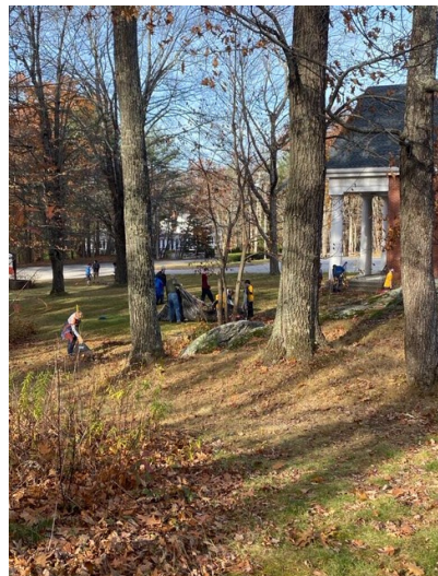
Fall Clean Up 2020

~ Kim Hendry, Moderator shendry001@maine.rr.com 207-756-9343